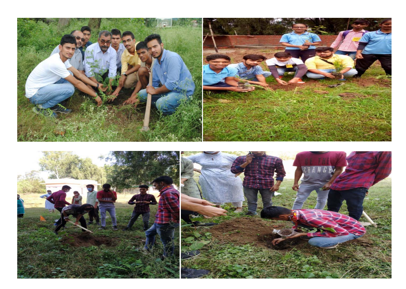
GLIMPS OF PLANTATION DRIVE ON VAN MAHTOSAVA