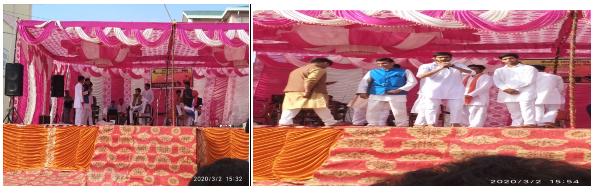
STUDENTS PERFORMING IN CSCA FUNCTION