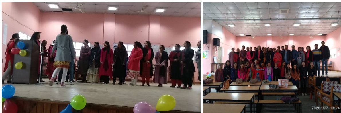
Figure 4 CELEBRATION OF INTERNATIONAL WOMEN DAY